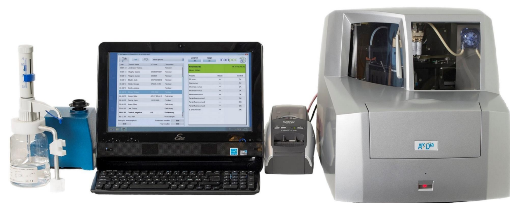
Figure 1. Automated and multianalyte mariPOC ® test system for point-of-care clinical diagnostics use.

mariAST ® (ArcDia International Ltd) is the only published product concept that allows rapid and real-time phenotypic antimicrobial susceptibility testing (AST) directly from polymicrobial clinical samples. It is based on the same separation-free ArcDia ™ two-photon excitation (TPX) fluorescence technique for bioaffinity assays as mariPOC ® (Figure 1). mariPOC ® is a fully automated platform for rapid and multianalyte identification of pathogens ( www.arcDia.com ). When the detection of live bacteria with specific antibody reagents is combined with in-well culture, the theoretical detection sensitivity is 1 CFU/well. In few hours one CFU multiplies to bacterial concentration that exceeds the level needed for positive fluorescence readout. We studied how well the theoretical sensitivity can be reached empirically for Staphylococcus aureus .